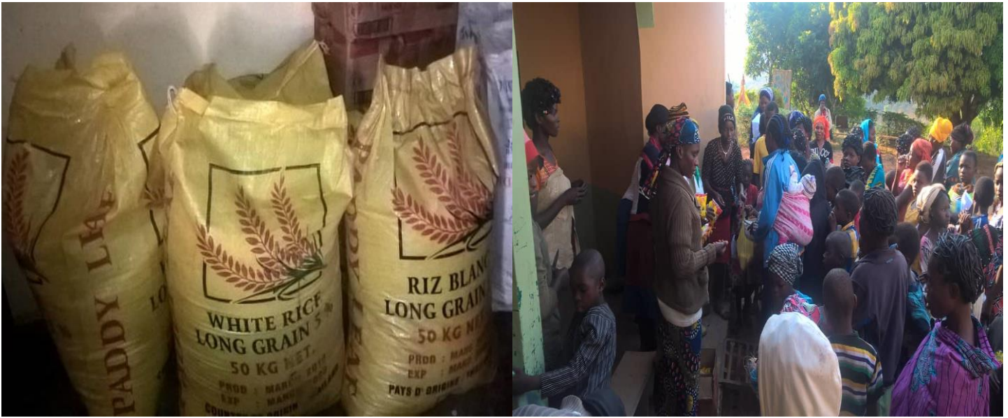
The less privileged in Kom Mfunte are not left out despite the accessibility challenges