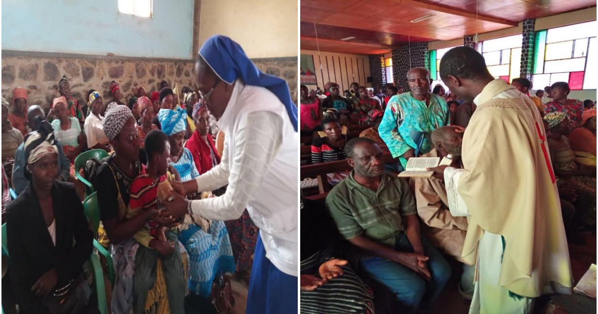
Together with the Parish Priest of Meluf, Caritas team ministers to the sick and the needy in Meluf parish