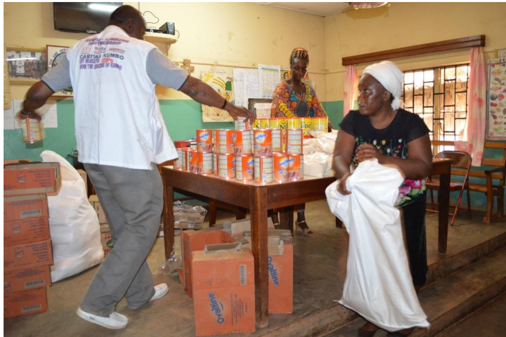
Putting items in display for distribution