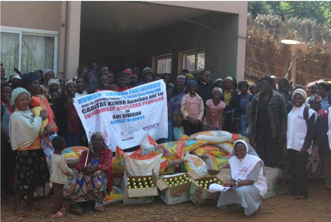
Outreach with food support to IDPs in Kikaikelaki