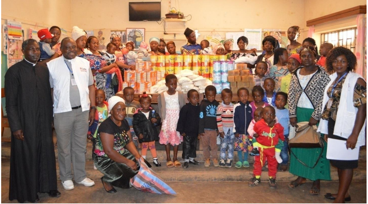
Beneficiaries pose with items before distribution