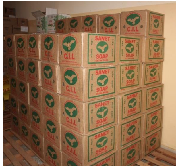
Delivery and stacking of items for distribution