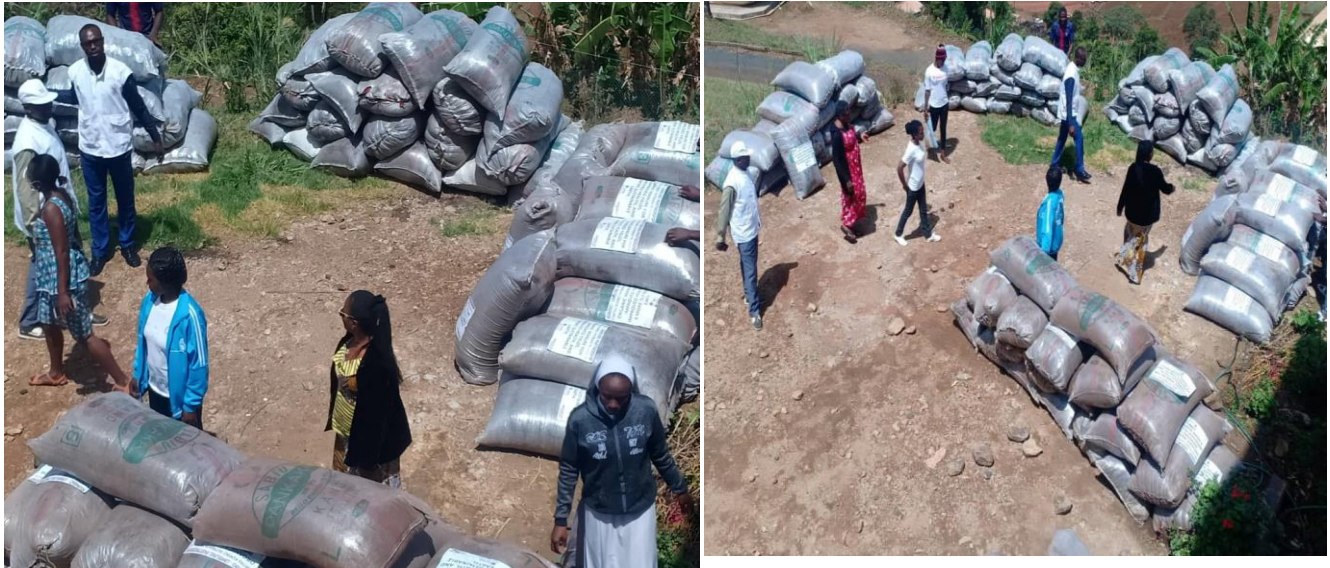
Caritas team labelling organic manure for distribution