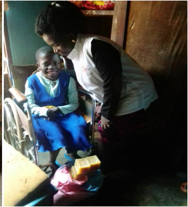
Putting smiles on the faces of the distressed, Melim parish