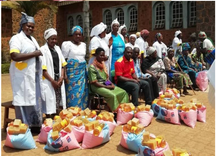
Meeting the sick, old and needy in Kumbo Cathedral Parish