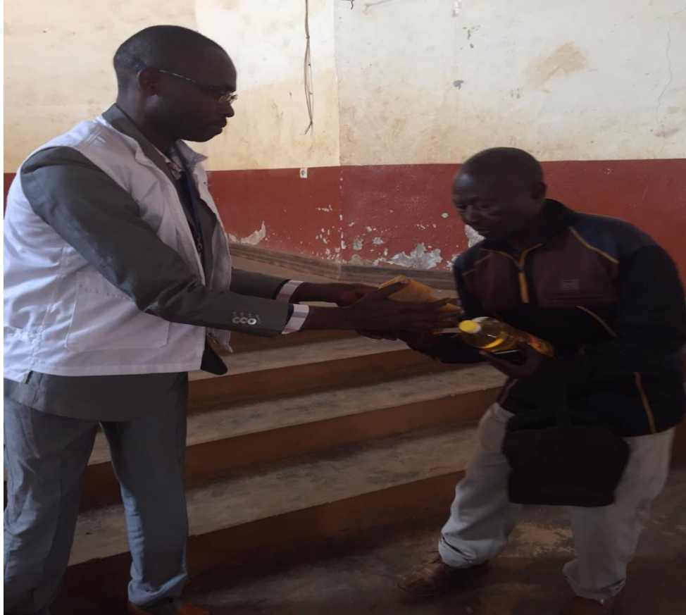
Ministering to the old and the sick in Melim