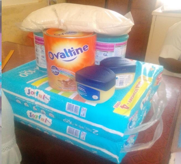
Bringing God's Love and hope to the sick and needy. Thank you Misereor and the Diocese of Limburg