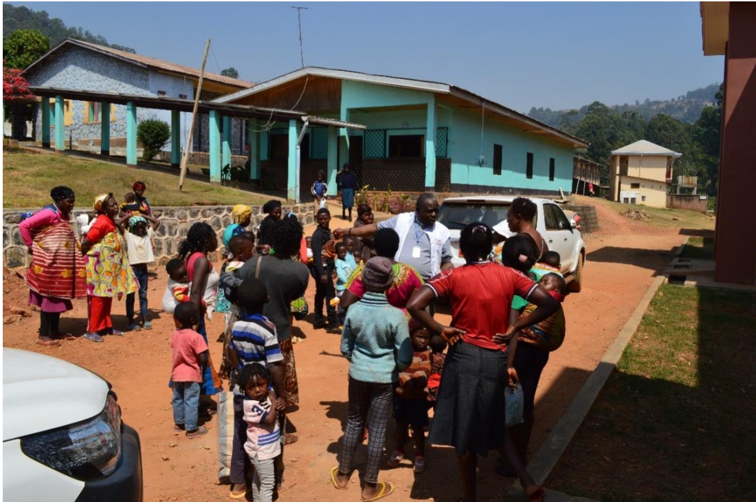
Those who arrived late taking appointment with the Coordinator of Caritas Kumbo