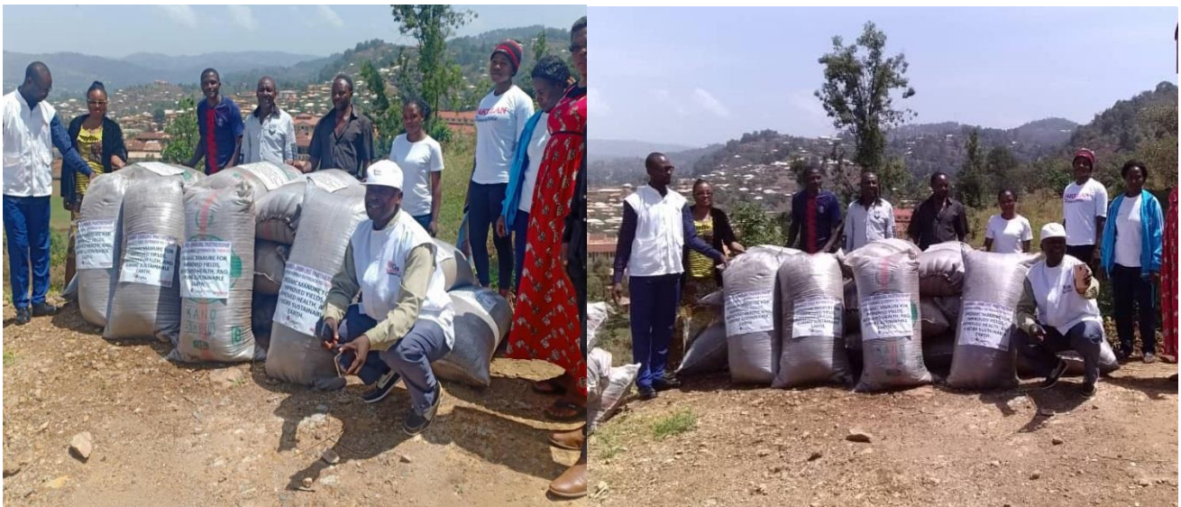
Some of the farmers pose with their manure after receiving guidance on best practice for application for optimum yields. This was given by the Agricultural training project staff