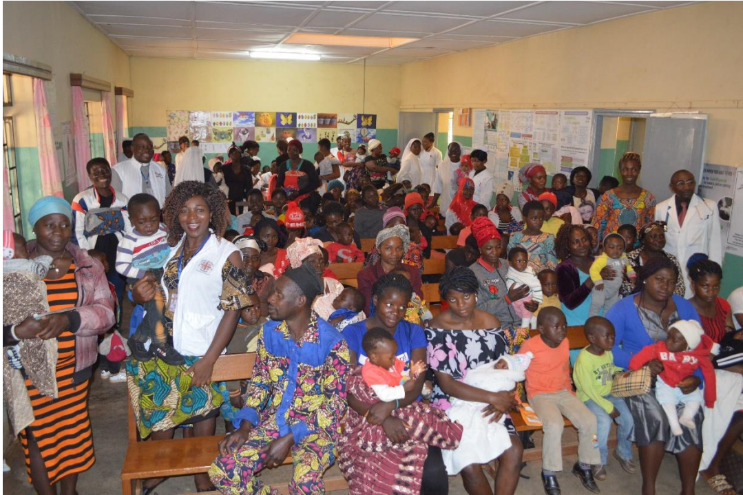
Beneficiaries and their parents pose with medical and outreach team