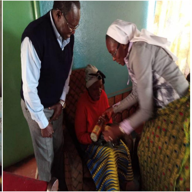
The old are not left alone. Njavnyuy parish