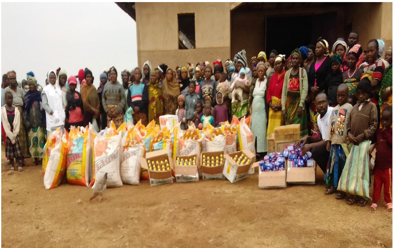
Dzeng parish beneficiaries pose with their food items, laundry soap and sanitary pads for adolescent girls