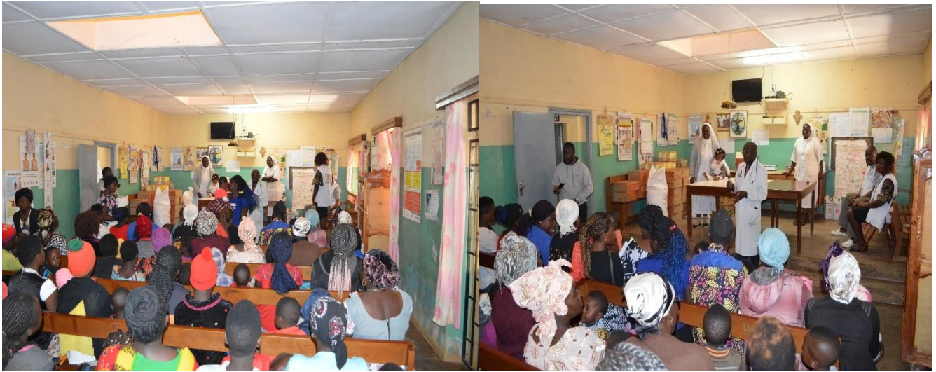
Young mothers and in some cases fathers receive health talk from health personnel