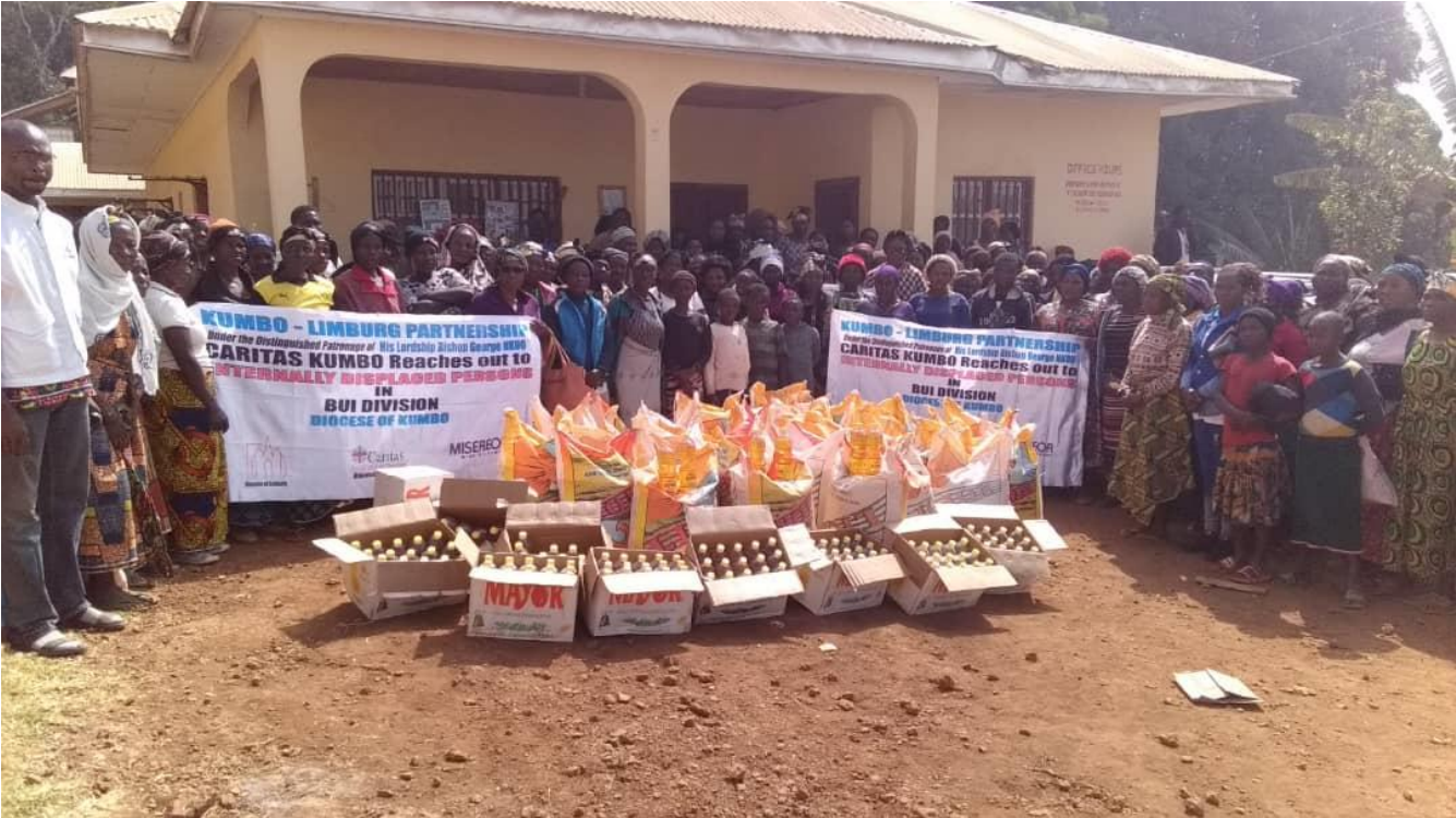
Kitiwum beneficiaries pose with their food items