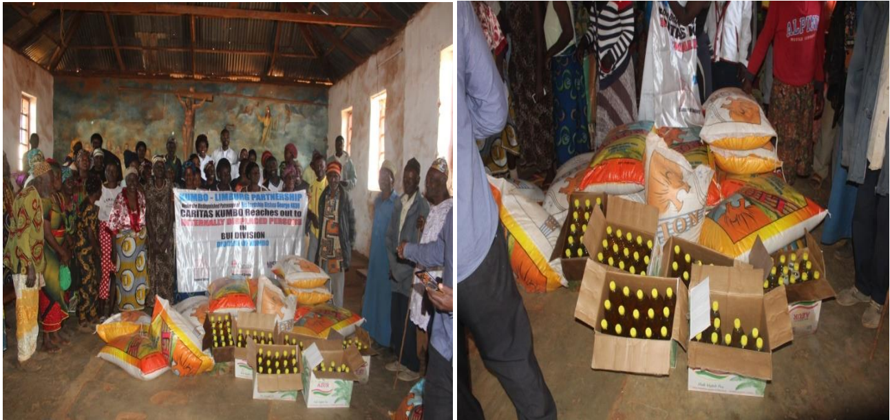
Displaced and affected persons in Kiyan Parish receive food support