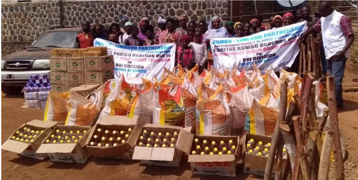
Ndzevru pose with their food items, sanitary napkins and laundry soap